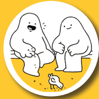
Pick your moment